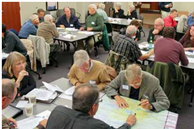
Public involvement helped prepare this plan and public involvement will help see that its recommendations are accomplished.

There are three key waterway opportunities that should be seized: (1) extending the Greenway up First and Oxford Avenues corridor, across the High Bridge and down the Forest Street corridor to Phoenix Park., (2) extending the Greenway along the length of the Eau Claire River and (3) extending the Greenway around Half Moon Lake. Each of these projects is eminently do-able.